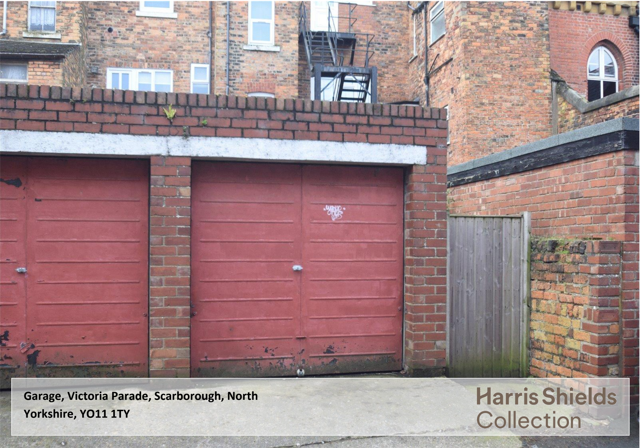
Garage, Victoria Parade, Scarborough, North Yorkshire, YO11 1TY